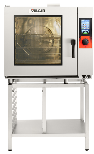
Model TCM61G Shown on optional stand