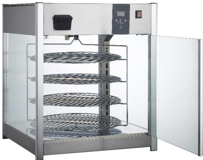
BMPW418 Pizza Warmer with Door Open