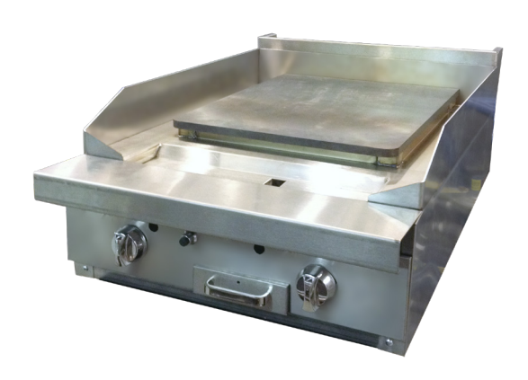
Model P24N-PP shown

** PLANCHA UNITS DO NOT ALLOW SPECIFIC TEMPERATURE OPERATION **