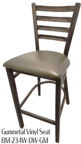
Gunmetal Vinyl Seat BM-234W-DW-GM