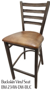
Buckskin Vinyl Seat BM-234W-DW-BUC