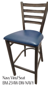
Navy Vinyl Seat BM-234W-DW-NAVY