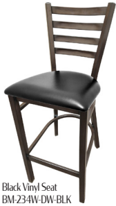
Black Vinyl Seat BM-234W-DW-BLK