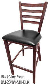
Black Vinyl Seat BM-234W-MH-BLK