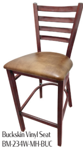
Buckskin Vinyl Seat BM-234W-MH-BUC