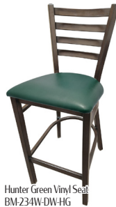
Hunter Green Vinyl Seat BM-234W-DW-HG