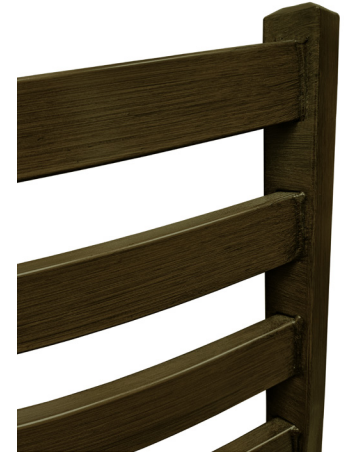
Driftwood Frame Finish