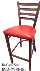
Red Vinyl Seat BM-234W-MH-RED