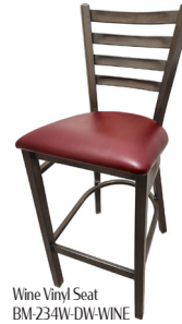
Wine Vinyl Seat BM-234W-DW-WINE