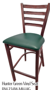
Hunter Green Vinyl Seat BM-234W-MH-HG