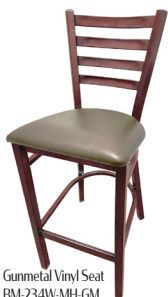
Gunmetal Vinyl Seat BM-234W-MH-GM