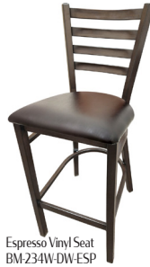
Espresso Vinyl Seat BM-234W-DW-ESP