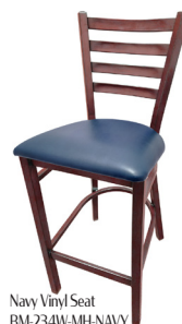
Navy Vinyl Seat BM-234W-MH-NAVY