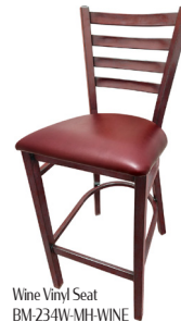
Wine Vinyl Seat BM-234W-MH-WINE