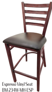
Espresso Vinyl Seat BM-234W-MH-ESP