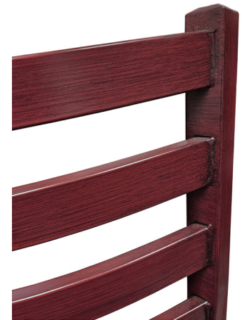
Mahogany Frame Finish