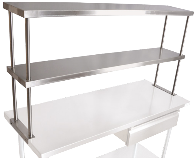
OS-ED-1248 (DOES NOT INCLUDE TABLE)