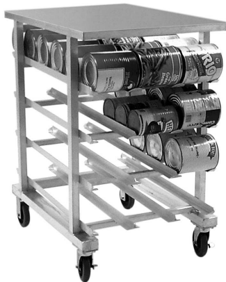
model #OCR-10-4A can rack with aluminum top

Eagle Panco® Half Size Mobile Can Rack, with 1/2"-thick polymer top, model _____. All-welded aluminum construction crossbraced front-to-back and side-to-side. Aluminum angle racks secured to frame at a slight angle to allow for gravity feed. Furnished with 4"-diameter casters. Capacity to be (54, 72) #10 cans or (72, 96) #5 cans.