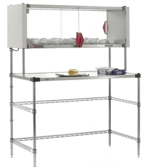
Heated shelf enclosure kit shown with a Super Erecta workstation.