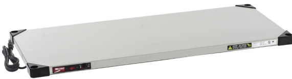
Use with Super Erecta Posts or Countertop Feet

Includes shelf, one bag of split sleeves and (4) plastic feet (posts not included). For actual dimensions add 5/8" (16mm) to depth and subtract 1/16" (2mm) from length.