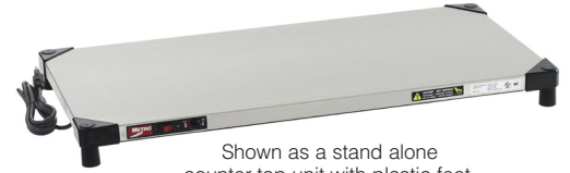
Shown as a stand alone counter-top unit with plastic feet.