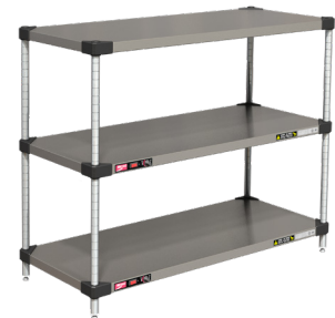
Shown as a tiered shelving unit.