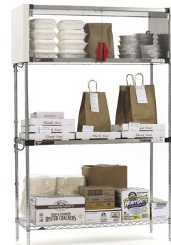
Shown with heated shelf, enclosure kit and standard Super Erecta shelving.