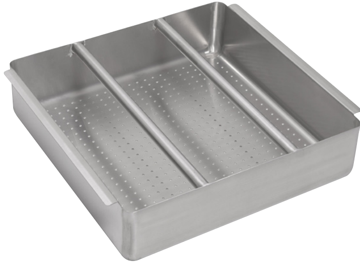
DISHTABLE PRE-RINSE BASKET