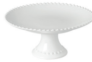
Footed plate 28

PER301 [1] 30.2 X 13.2 H2.1cm 11.75" x 5.25" H1" 02202F [93617]