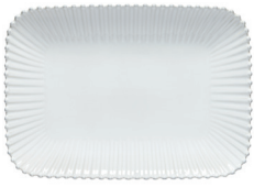
Rect. platter 40

PER403 [1] 39.6 x 28.0 H4.3 cm 15.5" x 11" H1.75" 02202F [93326]