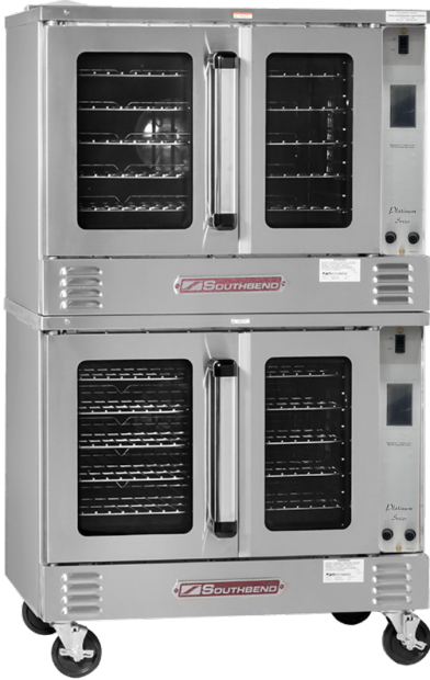
PCG100B/T shown with optional casters