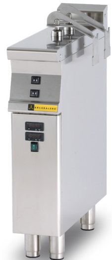
APCL35 3 Lifters