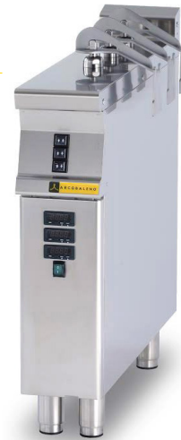
APCL28 2 Lifters