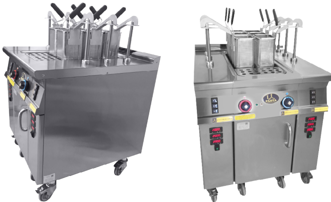
Pasta Cooker with 2 basket lifters right & left side