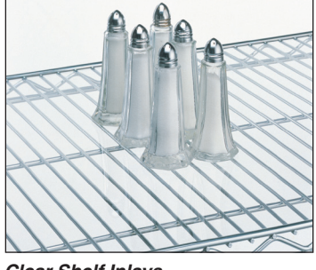
Clear Shelf Inlays