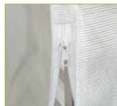
Opaque white vinyl, clear-view window, zipper closure