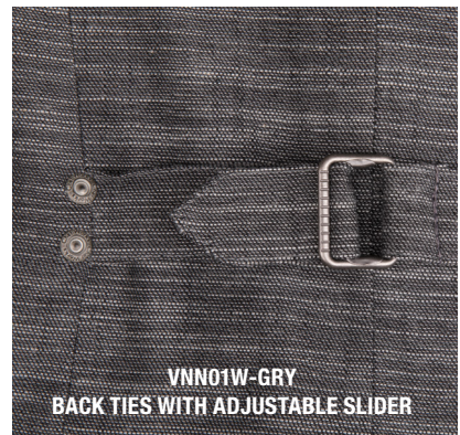
VNN01W-GRY BACK TIES WITH ADJUSTABLE SLIDER