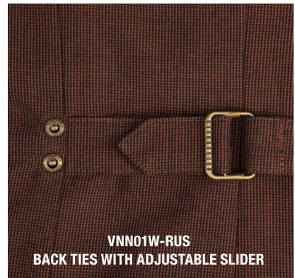
VNN01W-RUS BACK TIES WITH ADJUSTABLE SLIDER