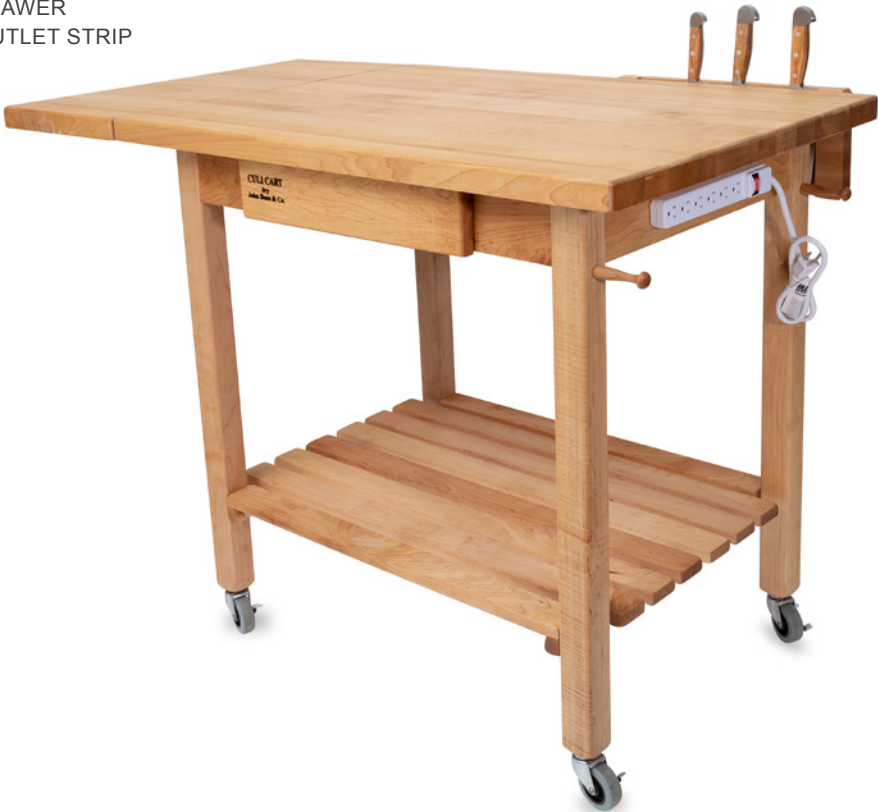
DELUXE CULI CART