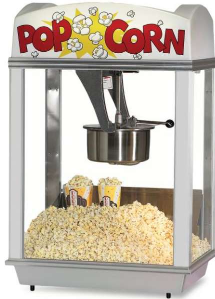
General reference image shown.