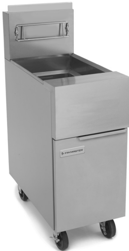
GF40 Shown with casters