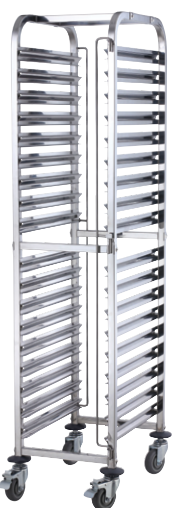
SRK-36 Fits a combination of full, half or third-size pans