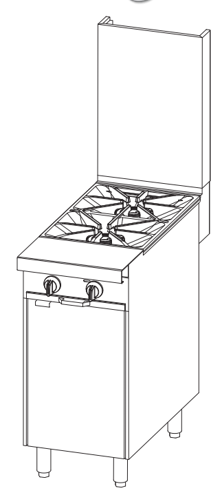
Model P16C-X with optional 24" flue riser and optional, removable cast iron grate top