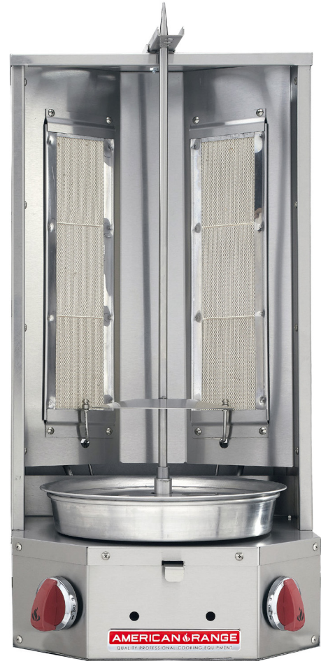
Model Shown AVB-2E