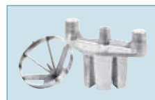
FWS-6BK Replacement wedger and blade for citrus fruits