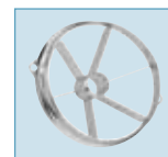
FWS-6BC Apple corer blade