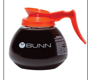
DECANTER, GLASS-ORN 12 CUP 1PK