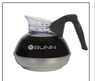
EASY POUR®,(BLK) 24/