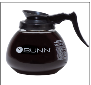
DECANTER,GLASS-BLK 12CUP 1PK