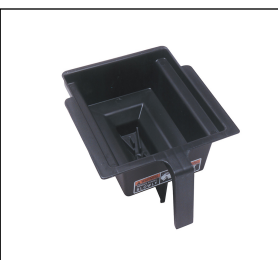
FUNNEL W/DECAL,PPK NAR BLK(LG)