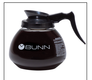
DECANTER,GLASS-BLK 12C 24/CS