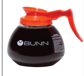
DECANTER,GLASS-ORN 12C 24/CS