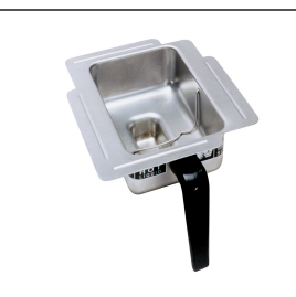
FUNNEL ASSY, SST-PP BLK HNDL