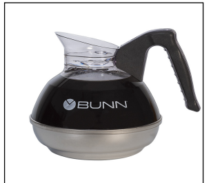
EASY POUR®, (BLK) 6/CS