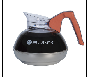
EASY POUR®,(ORN) 3/