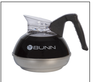
EASY POUR®,(BLK) 1/CS