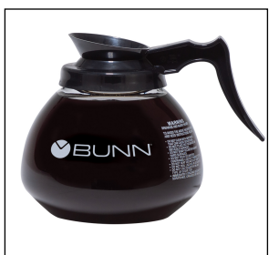
DECANTER,GLASS-BLK 12C 3/CS