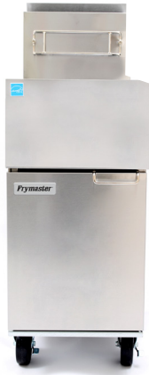
ESG35T Shown with optional casters