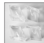
CUBE SHAPE Adjustable Thickness