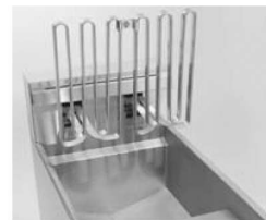
IFS-40-EU Tilt-up elements provide full access to the frypot for cleaning.