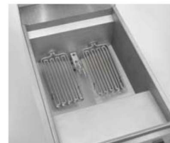
IFS-40-E Immersed element models are the lowest cost alternative for electric fryers.