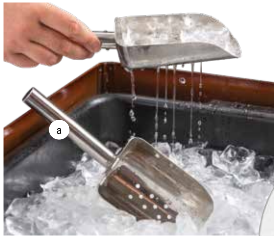
Features drain holes to prevent melted ice from watering down drinks