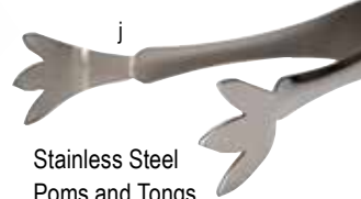
Stainless Steel Poms and Tongs