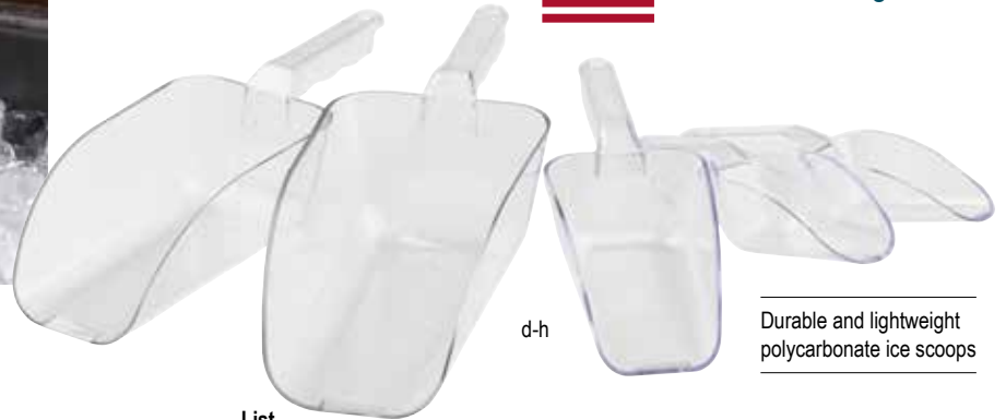
Durable and lightweight polycarbonate ice scoops