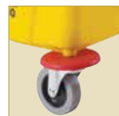
Non-marking casters with bumpers