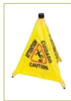
Set includes pop-up "Caution" cone