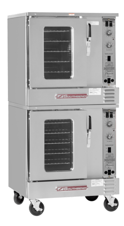
PCHG60S/S shown with optional casters