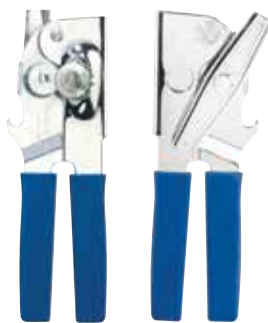
Front gears Back handle