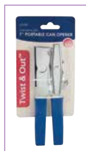
Twist & Out™ hanging packaging