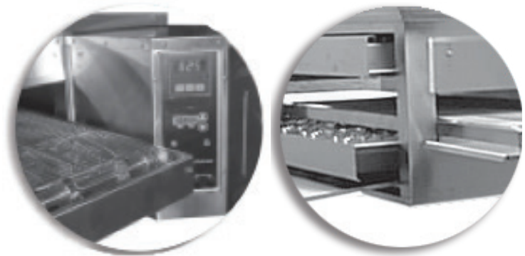
Removable panels for easy cleaning