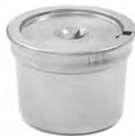
round inset and lid