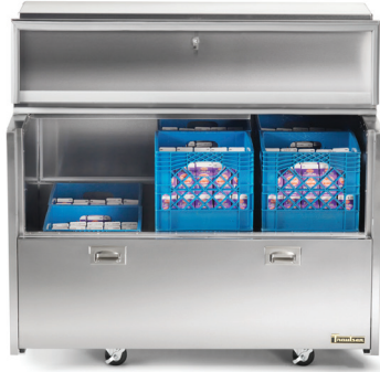
Model Shown - RMC49D4