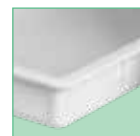
Reinforced edges & corners