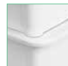
Seamless fit for fresh storage