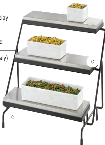
3-Tiered Half Size Cooling Display (CW40309B) Includes: (3) Half Size Cooling Plates and Black Powder Coated Stand