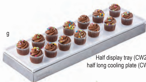
Half display tray (CW2107) on half long cooling plate (CW60103)