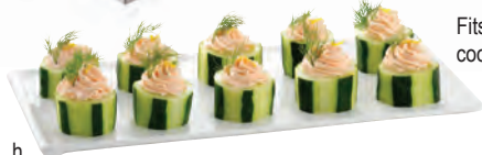
Fits on our gastronorm cooling plates