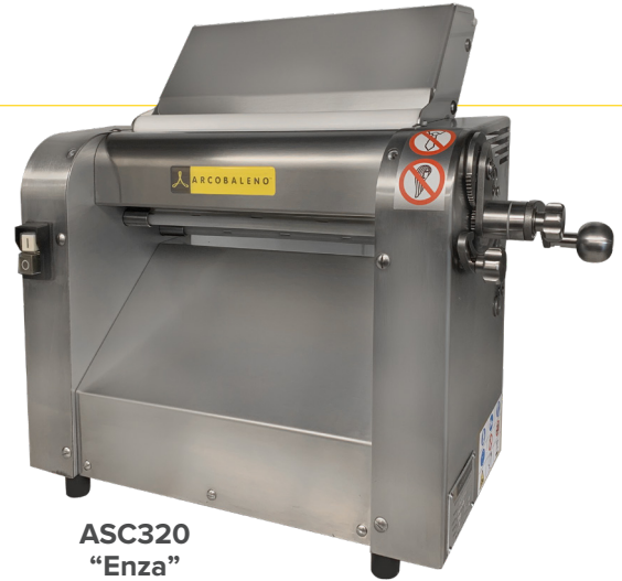
ASC320 "Enza" 12.5" dough sheet width