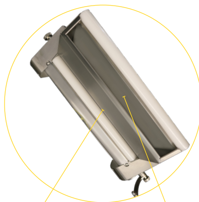
2 PASS SHEETER FRONT DOUGH FEEDER OPENING 3/8" BACK DOUGH FEEDER OPENING 1.5"