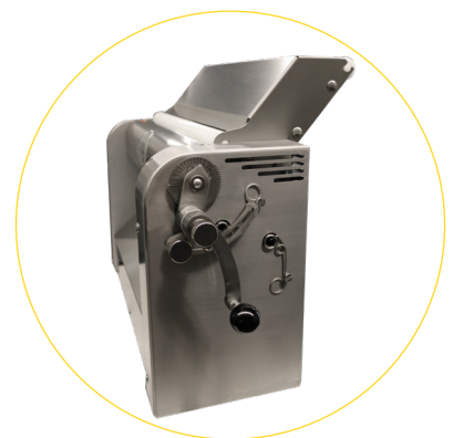
ERGONOMIC ULTRA COMPACT DESIGN

CAD file available. Please contact factory 717-394-1402. | Specifications subject to change without notice | © Copyright 2020 Arcobaleno™, LLC