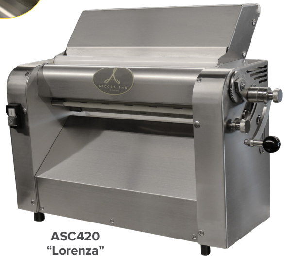
ASC420 "Lorenza" 16.5" dough sheet width