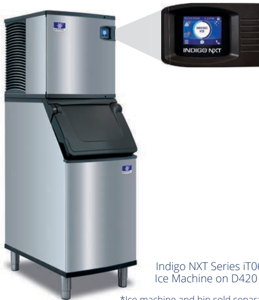
Indigo NXT Series iT0620 Ice Machine on D420 Bin