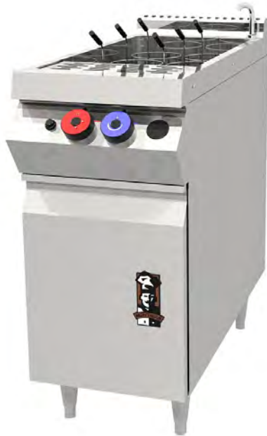
Model CPG-1 Pasta Cooker shown with optional round baskets