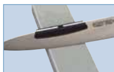
K-4G in use