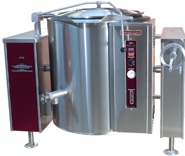
Shown with optional spring assist cover