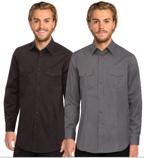
3.8 oz. 64/34/2 poly/cotton/elastane, roll-up long sleeve with button tab, buttoned front and 2-button cuffs, 2 front pockets with flaps Available in BLK, GRY