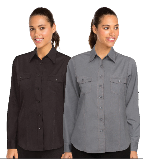
3.8 oz. 64/34/2 poly/cotton/elastane, roll-up long sleeve with button tab, buttoned front and 2-button cuffs, 2 front pockets with flaps Available in BLK, GRY