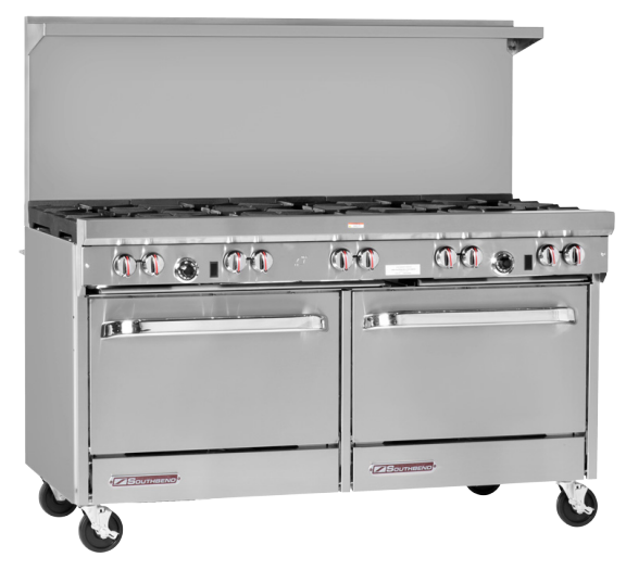
S60DD (shown with optional casters)