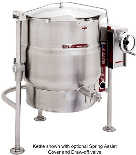
Kettle shown with optional Spring Assist Cover and Draw-off valve