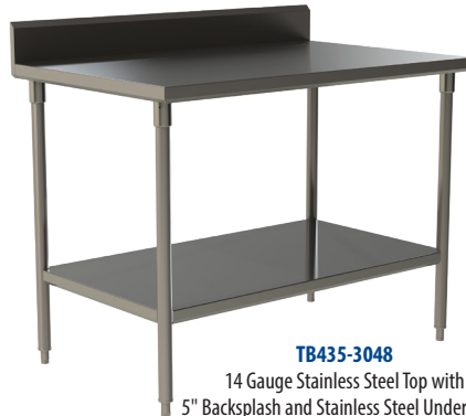
TB435-3048 14 Gauge Stainless Steel Top with 5" Backsplash and Stainless Steel Under Shelf