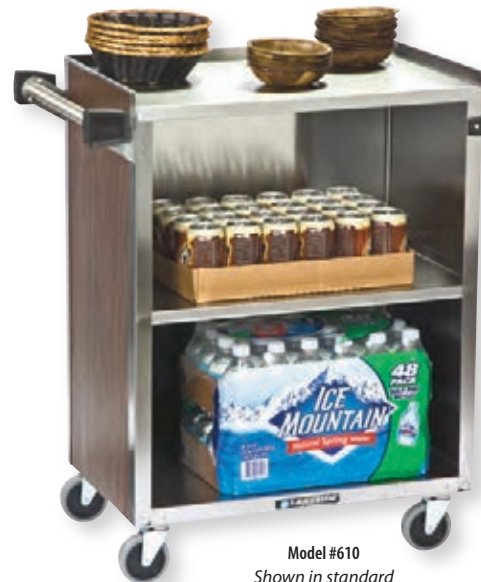
Model #610 Shown in standard Walnut vinyl

Freight Class: 125 Ships in: 4 days or less!