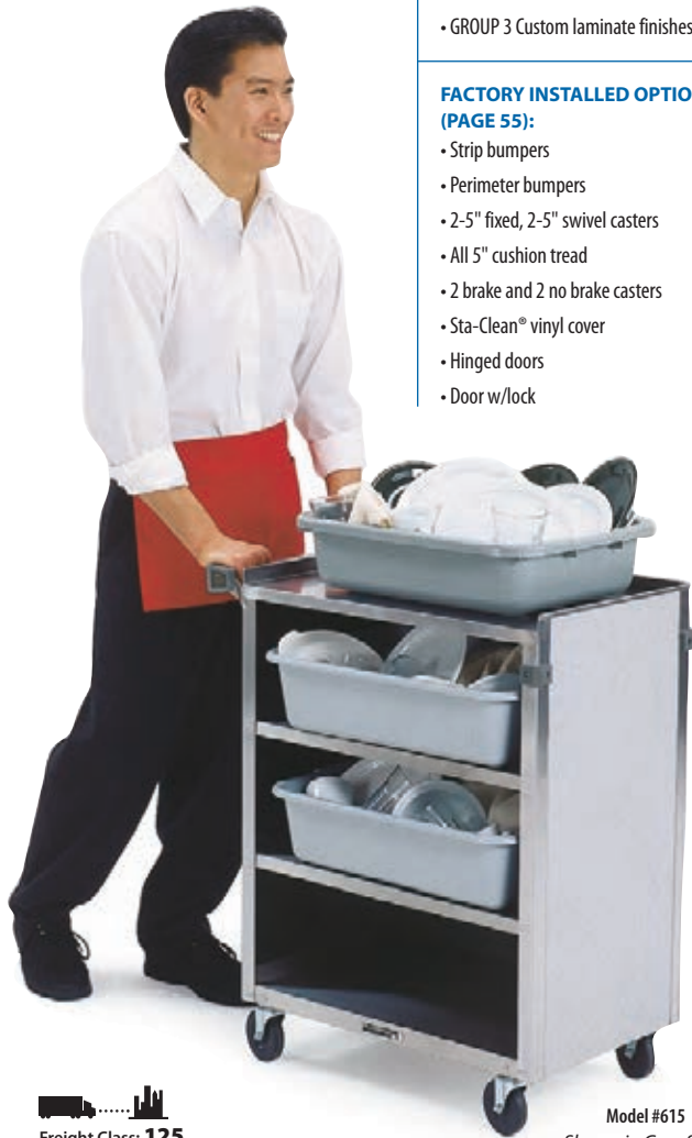
Model #615 Shown in Gray Sand

610, 615, 622, 626, 644, 646, 810, 815, 822, 844