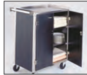
Factory Option: Hinged Doors