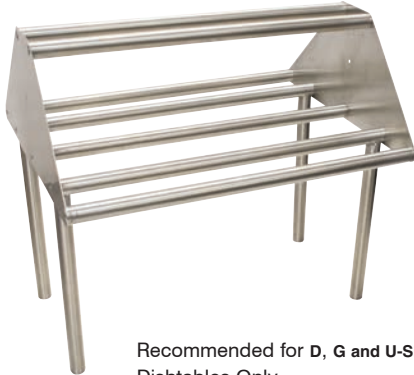
Recommended for D, G and U-Shaped Series Dishtables Only.