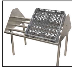
OPTION 1: Lower Angle (Racks cannot be back to back)

*Shelf ships separately from table to reduce freight costs and chance of shipping damage. Entire unit may ship pre-assembled from factory where special applications exist. Consult factory. Per Linear Foot. Minimum Length 48"