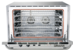
4 removable racks standard