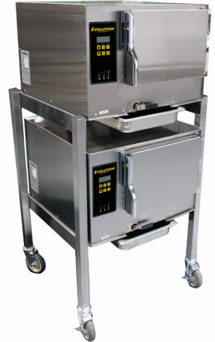
E3 Evolution™ models shown double-stacked on stand with optional casters and drain pans

Evolution™ steamer is AccuTemp Products' electric, connectionless, boiler-free steamer that utilizes AccuTemp's patented Steam Vector Technology™ for faster cook times, improved energy efficiency, and better pan-to-pan uniformity. Steam Vector Technology utilizes no moving parts inside the cooking chamber. Steam is produced inside the cooking cavity with no heating element exposed to water. Certified holding cabinet. No water or drain line. Steamer includes low water, high water, over-temp warning lights and auto shut off feature. Evolution includes heavy duty, one-piece field reversible door. Standard digital controls with independent timer. No water quality exclusions in warranty. No water filtration or treatment required. Lifetime Service & Support Guarantee. Steamer is UL Safety and Sanitation Certified, and ENERGY STAR® qualified. Made in the USA.