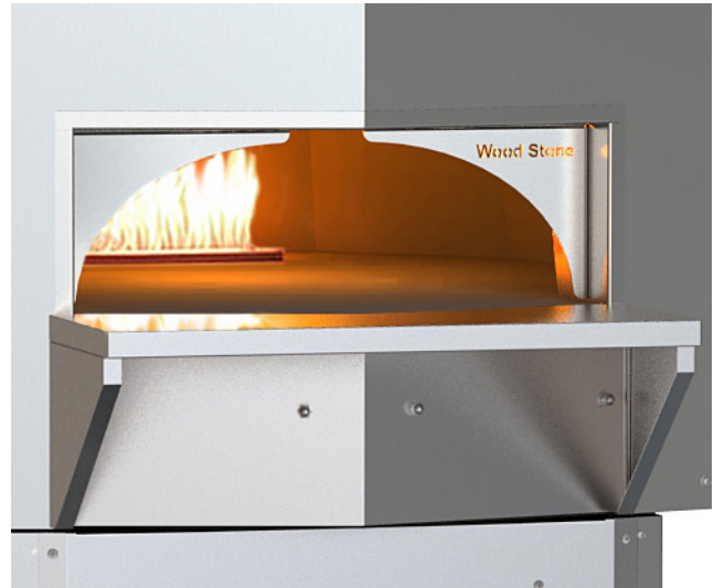
WS-MS-5-RFG-IR model with stainless steel Mantle and stainless steel Mantle Bracket shown.

If you're planning to build your oven into a facade wall, please visit the Facade Tutorials section on the Wood Stone website.