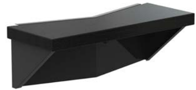
Mantle Bracket: Black Powder Coat Finish