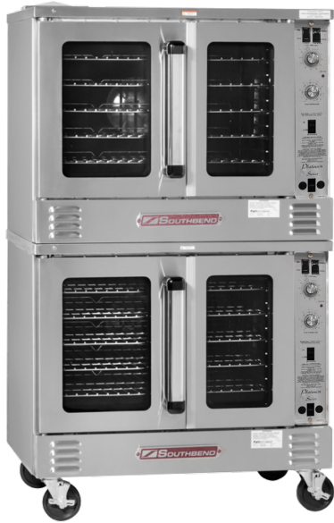
PCE15B/S shown with optional casters