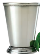
Stainless Steel M37032