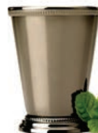
Gun Metal Black M37032BK