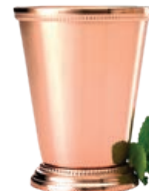
Copper Plated M37032CP