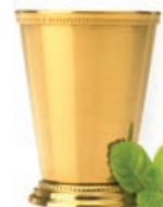
Gold Plated M37032GD